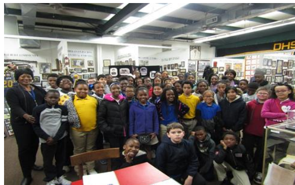
Students from Havana Magnet School, February 2019.

The museum has a website which has attracted since 2009, 99,748 people from around the globe. Many have made trips to Thomasville for a tour of the museum and to visit our historical town. Visitors to the museum have made positive comments on the uniqueness of its' collection and preservation of artifacts.