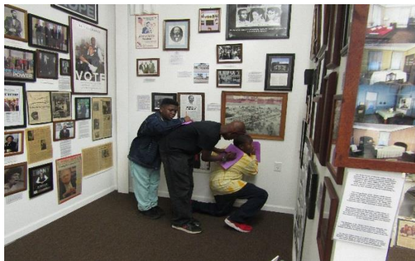
7 th grade students from MacIntyre Park; February 2018