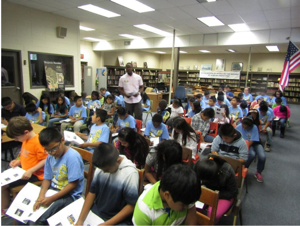
Elementary Students from Northside Elementary, Cairo, Georgia. The educator briefs the students prior to activity in the museum. February 2018)

The museum has a website which has attracted since 2009, 99,748 people from around the globe. Many have made trips to Thomasville for a tour of the museum and to visit our historical town. Visitors to the museum have made positive comments on the uniqueness of its' collection and preservation of artifacts.