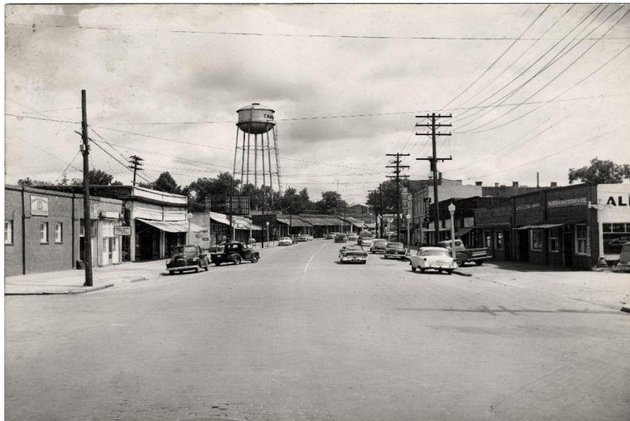
The “Bottom” located in the 300 Block of West Jackson Street, Thomasville, Ga. This was Thomasville’s Black Business District during the 1920 to 1970s.