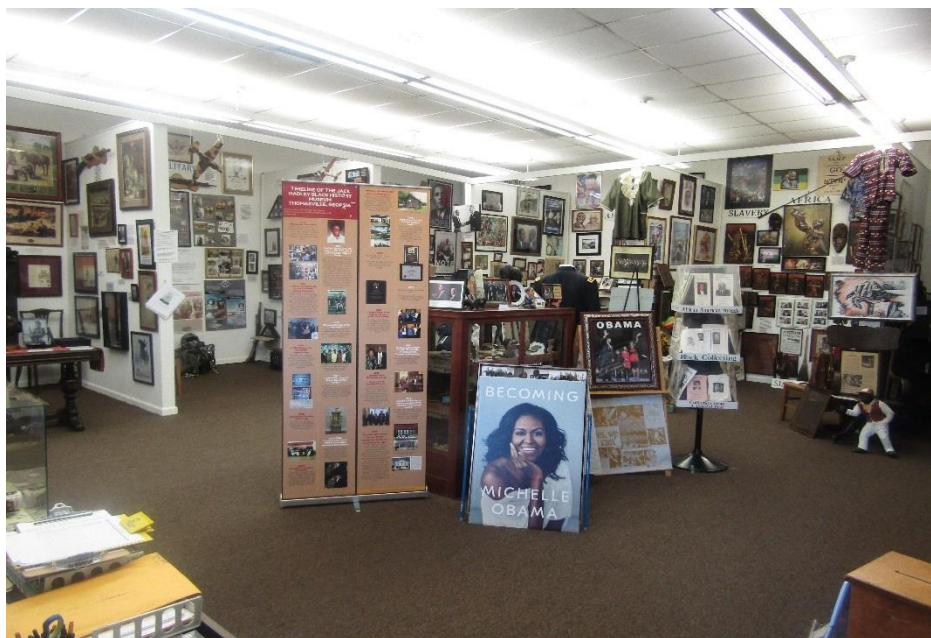
Display in gallery one of the JHBHM.