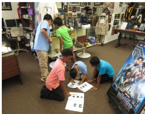
Students from Northside Elementary Cairo, Georgia. February 2018.

Museum Educator has developed historical local, state and national Scavenger Hunt activities for students of all grade levels. Students come to this museum to learn more about how African Americans have contributed to help build and shape our country, the United States.